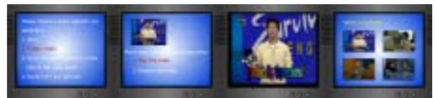
6. STB UI

KBS EBS " EBS " , 720x480 SD(Standard Definition) MPEG-2 . MPEG-7 MPEG-7 Summarization DS hierarchical summary MPEG-21 Part 가 가 가 STB(Set-Top -Box)